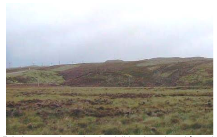
Fig. 5: Existing mounds on the site visible when viewed from the south