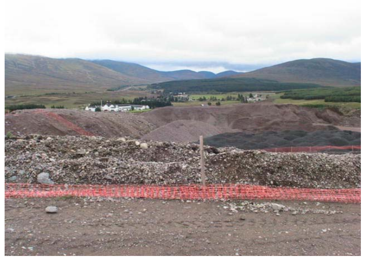
Fig. 2: View over existing quarry area, looking towards Dalwhinnie