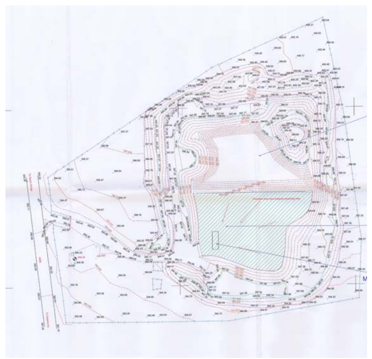
Fig. 3: Proposed site layout plan, with the shaded green area identifying the extent of the area which it is proposed to work to a greater depth.

3. Given that the annual rates of extraction cannot be accurately gauged, it is not possible to ascertain details of the number of daily vehicle movements likely to occur, although the applicants have estimated that movements over a one year period could vary from 1,000 to 2,500 lorries,<sup>3</sup> with all of those entering and exiting from the A9, using a limited area of the A889 to access the site and then travelling back onto the A9.