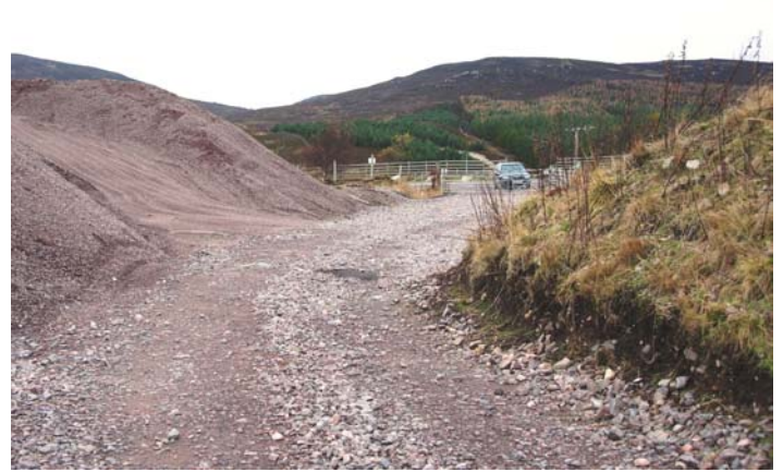
Fig. 4: Access route from the quarry towards the public road

22. Transport Scotland - Trunk Roads Network Management Directorate has recommended that one condition be attached in the event of the granting of planning permission. The condition stipulates that the bellmouth should be surfaced in bituminous macadam for a distance of 15 metres from the edge of the trunk road, in order to ensure that vehicles entering and exiting the access can undertake the manoeuvre safely and with minimum interference to the safety and free flow of traffic on the trunk road.